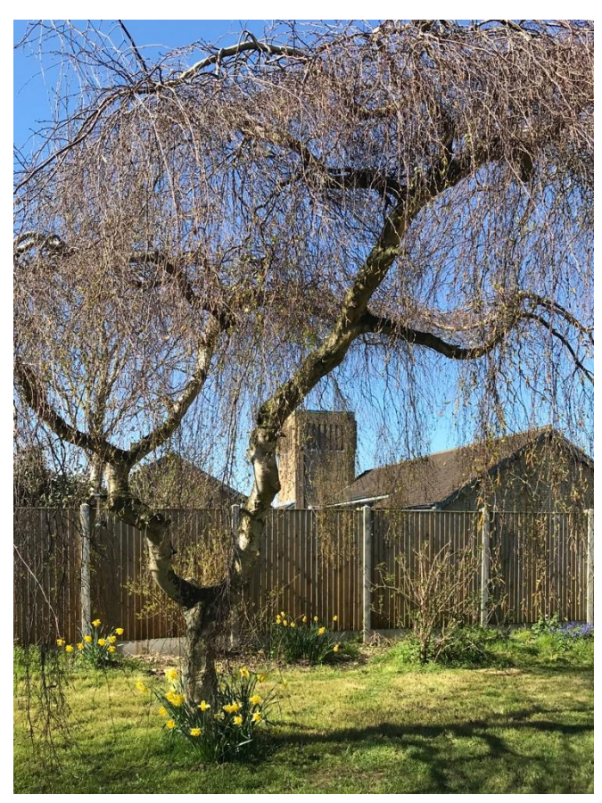
The Vicarage Garden – 21<sup>st</sup> March 2020

Today we begin a new way of being church.