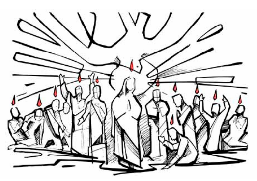
Humble yourselves therefore under the mighty hand of God, so that he may exalt you in due time.

Beloved, do not be surprised at the fiery ordeal that is taking place among you to test you, as though something strange were happening to you. But rejoice in so far as you are sharing Christ's sufferings, so that you may also be glad and shout for joy when his glory is revealed. If you are reviled for the name of Christ, you are blessed, because the spirit of glory, which is the Spirit of God, is resting on you.