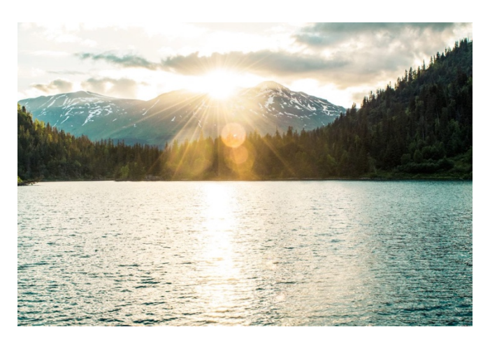
O Lord, how manifold are your works!