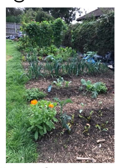
Weeding, Sowing, Planting, & 10.15 am Tea And Cake Break LOTS OF FRESH VEG TO BE PICKED COME AND GET IT!