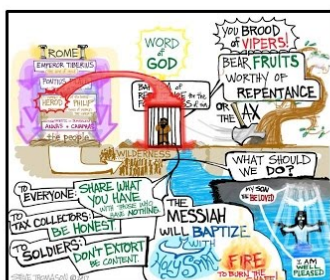
A Visual Guide to Luke 3:1-22

So, with many other exhortations, he proclaimed the good news to the people.