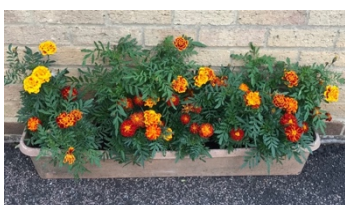
Some of the plants that grew from 'Let it Grow' Seedlings last year.