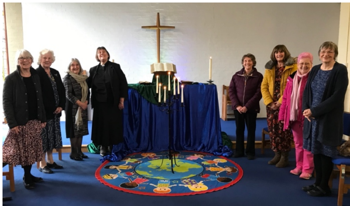
The World Day of Prayer Team

On Friday 4 th March, St Francis hosted the Norwich East World Day of Prayer Service. We were delighted with the turnout and it was a joy to worship together with so many old friends from local churches.